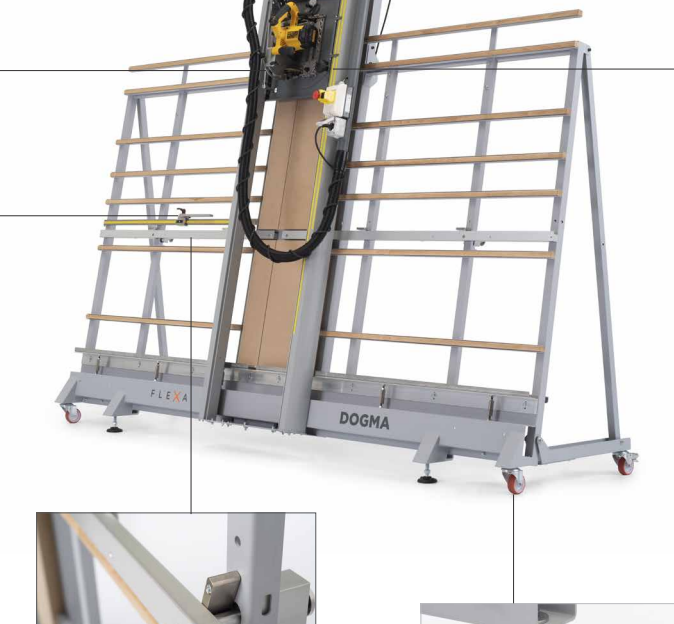
Reference bar mounted on a practical millimeter scale for fast and precise cuttings