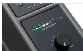
Roller pressure display