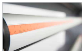
Millimeter scale on each shaft for the right positioning of the media