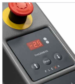
Motorized lifting of the upper roller (optional)