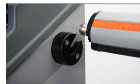
Aluminum shafts with automatic locking system