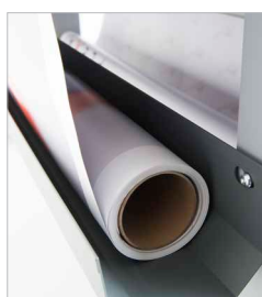
Front tray for prints (optional)