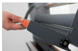
Swing-up steel feed table for quick set-up