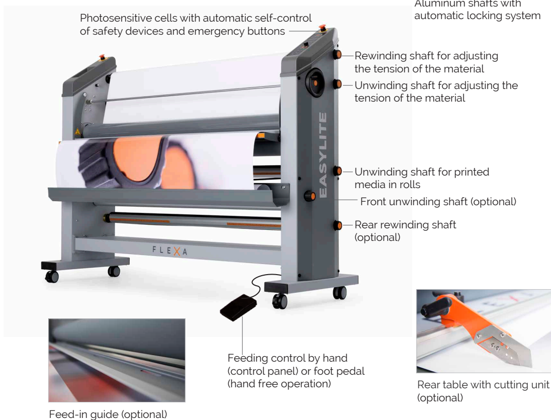
Feed-in guide (optional)