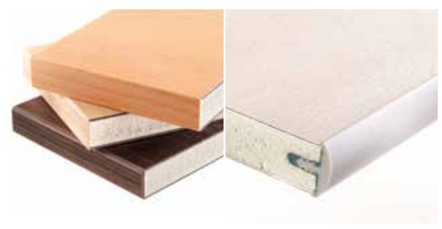
Laminated with HPL, edges sealed with an ABS profile