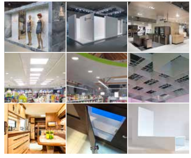
Various applications from the fields of stand and furniture construction, shop fitting as well as transport and industry